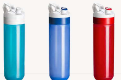
2600 aqua transp.